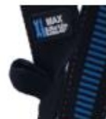
2.3kg tool loop