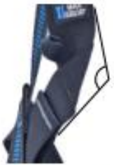
Patented hip fold