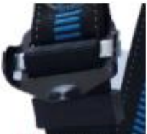
Alloy bar webbing adjuster