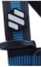
Break-away lanyard park loops