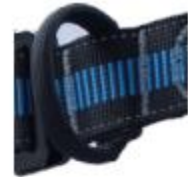
Soft UHMPE front attachment loop